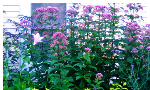
Eupatorium 'Little Joe'