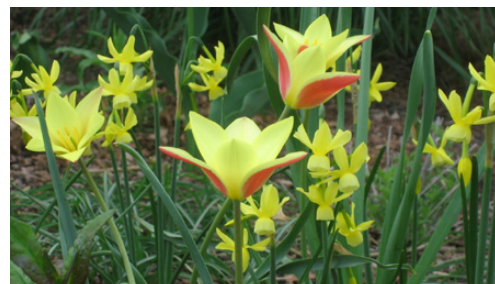
Tulipa Tinka and Narcissus Hawera-Tinka

Enjoy your time outdoors in this beautiful fall weather. The colors are absolutely dynamite this year! Anyone want to help me rake?