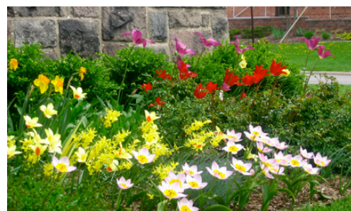
Tulipa Lilac Wonder with Narcissus Hawera